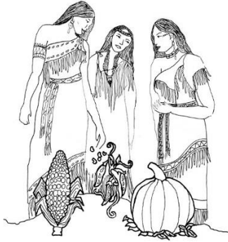
Three sisters - corn, beans and squash

Welcome back after a wet and hot summer. Please take note of the pathways of history information and show up when you can. the committee has worked long and hard to accomplish this monumental feat. We have taken apart the entire museum; cleaned it; and now it's ready for visitors. I am sure everyone will be impressed. Many of the artifacts will be on display; some you have never seen before.